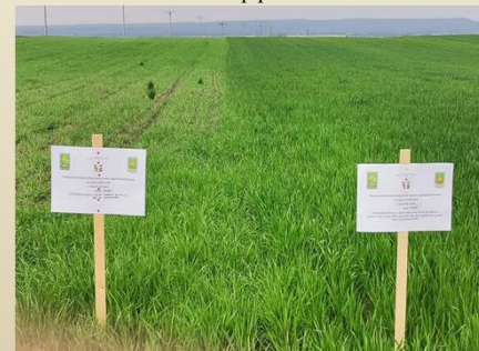
Figure 2. Differences between pepper plants, the upper yellow variety. a. Rom-Agrofert NP, b. Azoter, and c. NPK chemical fertilized plant.